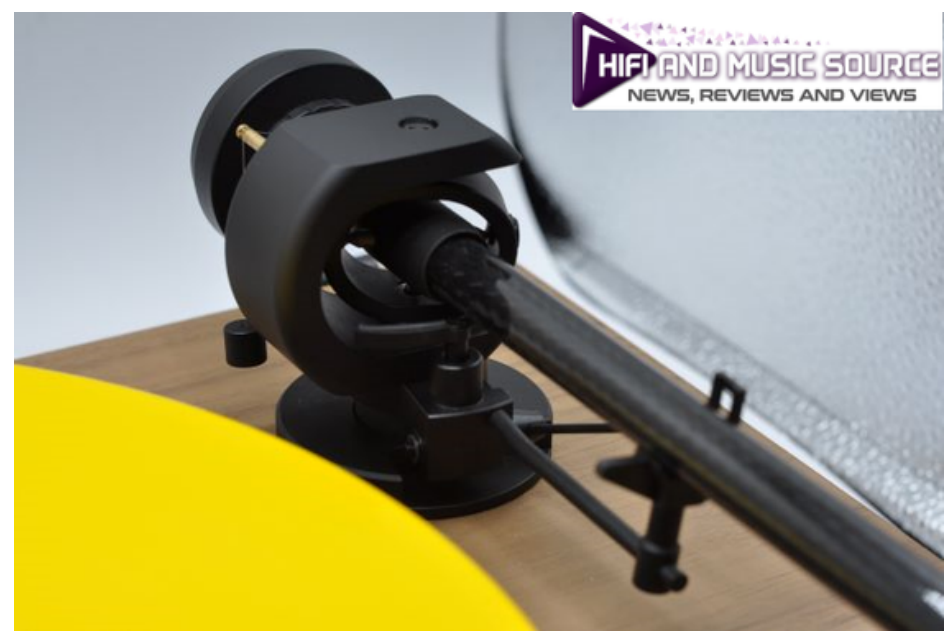
Pro-Ject tonearm assembly

On dropping the needle with a soft touchdown, there is little discernible noise through the Titans. I have a wonderful moment with Arooj Aftab's album as her track Inayaat drifts hauntingly along, the harp and then the flugelhorn are so clear it is mesmerising. The depth in the bass from the track Last Night is evident in the lovely snare vibration in the background of the soundstage. The room echo is lovely in this setup and the double bass is controlled and punchy. Indeed, this is everything you strive for in vinyl record playing, particularly after a nice clean.