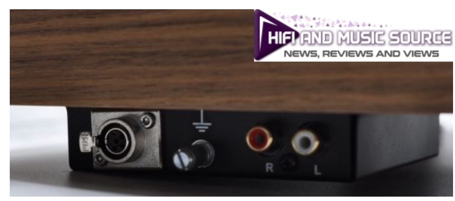
Balanced and unbalanced output are available

The usual tonearm lever is a soft floating affair, and although the Ortofon Quintet Red moving coil cartridge is a bulky block it is actually very easy to cue up. With the arrival of the Pro-Ject Phono Box S3 B, the input impedance for the Ortofon Quintet Red is set to 50 ohms and the input gain is set at 60dB. The input capacitance, apparently, is not relevant for low-output moving coil cartridges.