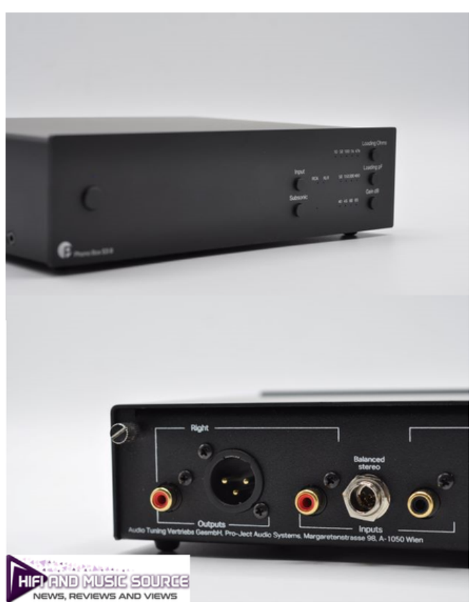
Pro-Ject Phono Box S3 B front and rear with balanced and unbalanced inputs

This arrangement is then improved by adding the Pro-Ject Phono Box S3 B which has the balanced input that this turntable will benefit from. It is hard to think the existing setup could be improved but we are in a world of marginal gains.