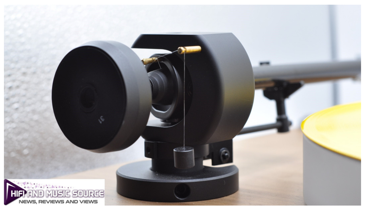
Pro-Ject X2 B tonearm assembly detail and anti skate detail

The unit, Pro-Ject claims, is hand built in the EU. The dimensions are 460 \times 150 \times 340 mm (WxHxD), and it weighs 10kg. The X2 B is priced at £1,399 with Henley Audio at the time of writing. The Pro-Ject Phono Box S3 B is priced at £349, also available at Henley Audio.